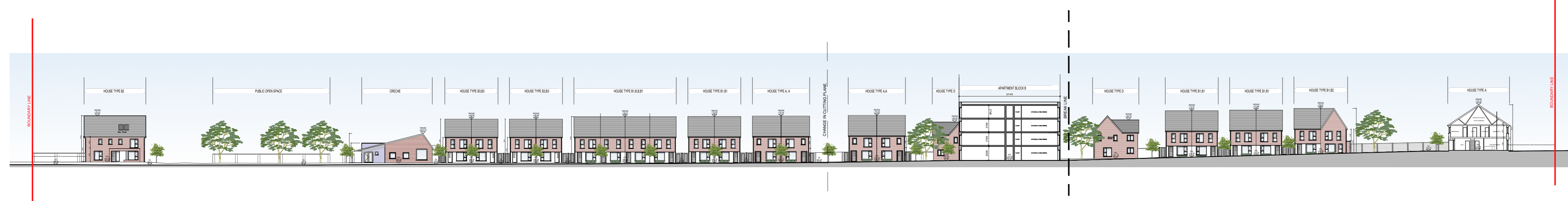
01 SECTION B - B SCALE 1:500 @ A0