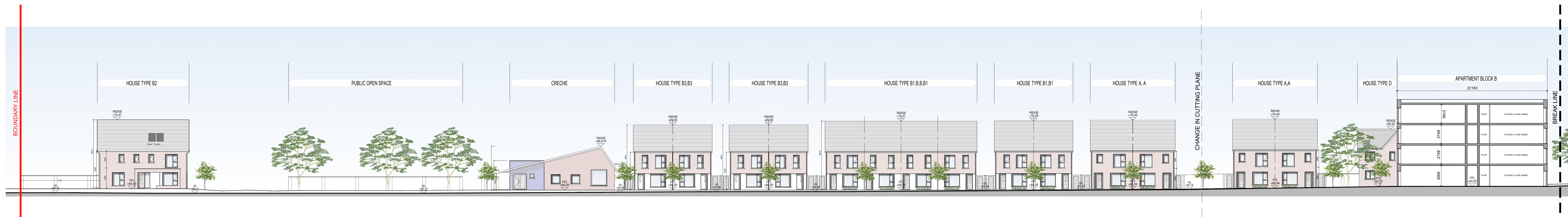
02 SECTION B - B SCALE 1:200 @ A0