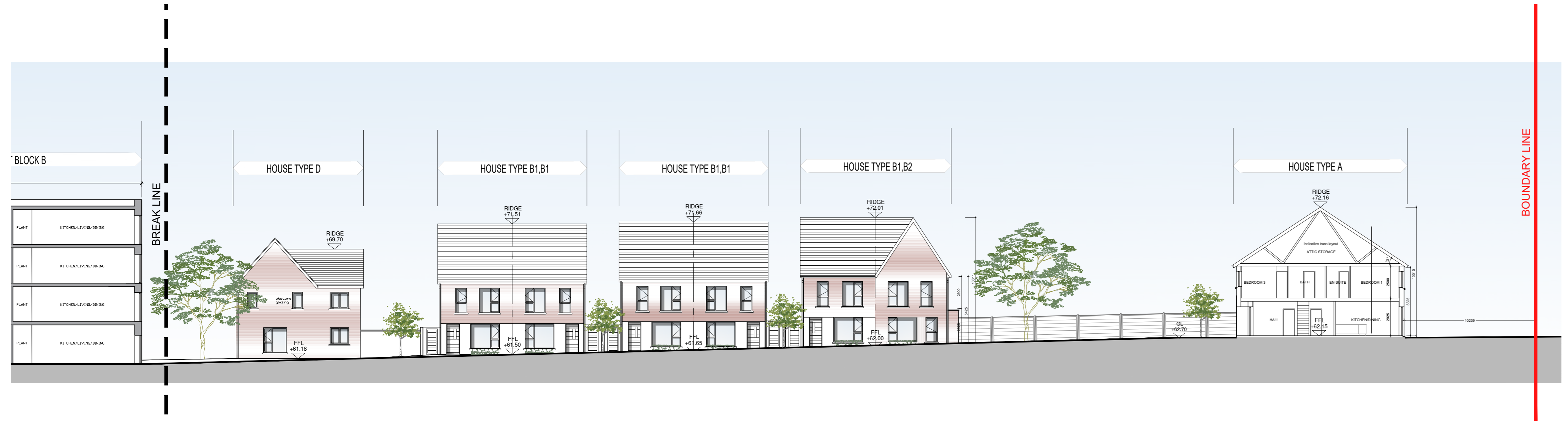
03 SECTION B - B (cont) SCALE 1:200 @ A0